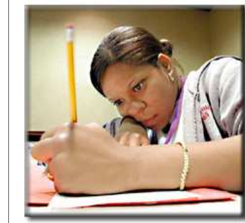
Journaling enhances student ownership of the L2

I have used journaling while teaching French in the U.S. and English in the U.S. and Qatar. In both instances, the L2 was being taught in the target language. Remarkable results followed after consistent usage (approximately three to five days a week for 10 to 15 minutes for each writing effort for the entirety