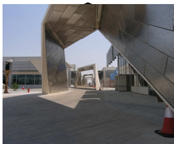
College of the North Atlantic-Qatar will host the conference April 14-15.