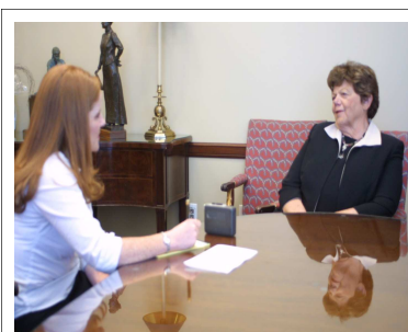
Interview a well-known professional.