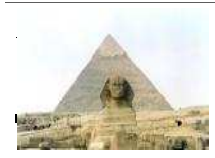
EgyptTesol held its Sixth Convention in December, 2005.